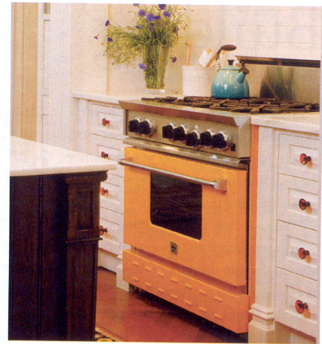
The BlueStar range adds a bit of color to the kitchen.