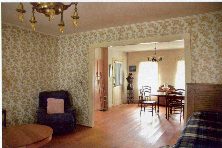
The living room and dining room were opened up by removing walls and part of the ceiling, as well as changing windows.