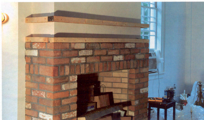
Original bricks from the home were used as part of the new fireplace. Bill Muscara constructed a mantel with rough-sawn lumber, which mirrors the materials and techniques that were employed almost two centuries ago.